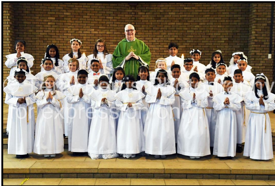
Holy Rood Catholic Church First Holy Communion 2022

Thank you, Lord Jesus, O thank you For giving yourself to me. Make me strong to show your love Wherever I may be.